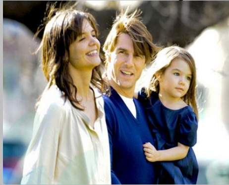
Tom Cruise, Katie Holmes and Suri Cruise

Birthday parties will always have those moments we remember, good or bad. Celebrity parents dish out thousands of dollars to ..... their kid's birthday parties. Imagine being little fashionable Suri Cruise celebrating with actors dressed up as favorite characters and frolicking with animals for a cool $200,000. Most of us can't even remember Suri Cruise second birthday and Suri, now 7, probably didn't either, but Katie Holmes and then hubby,